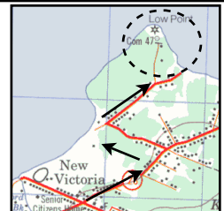
To Low Point Lighthouse

This route offers breathtaking views of the harbour and the ocean beyond. Its hard to top an early morning cruise on this route - it's good for the soul and the heart.. A great picnic option is to visit the Low Point Lighthouse at mid trip (1 km past the church at the end of Brown Street). Diversions along the route include the Whitney Pier Museum that chronicles this distinctive and diverse neighbourhood, Fort Petrie, part of the naval fortifications of Sydney Harbour and the ever popular Polar Bear Beach. The route is presented as a loop but shore route alone is great return trip. The inland section offers a break from the ocean breezes and a spectacular view of the city and it's harbour from the top of Lingan Road..