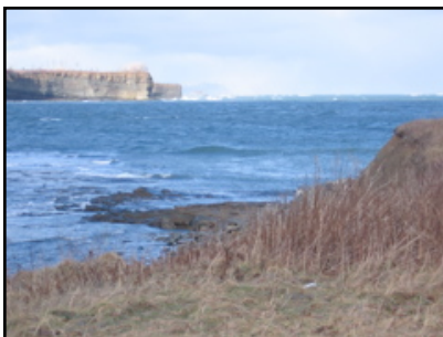
Little Bras d'Or Strait at Alder Point.

Adjacent Routes: #6 Northside Loop, #9 Pt. Aconi.