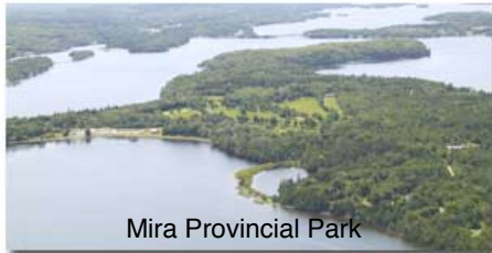
Mira Provincial Park

Adjacent Routes: #12 Mira Centre, #8 Main-à-Dieu/Louisbourg